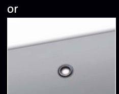
Calendar without hanger (straight header)

Date cursor and numbers in original size.