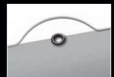
Calendar with hanger ...

Thereby, the transparent carrier film for the date cursor is slightly coloured, harmoniously coordinated with the colour of the previous and following months of your advertising calendar.